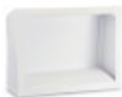
<<<<<<<<Example of box provided