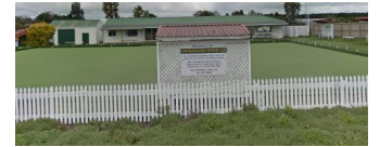
Maungakarama Bowling Club

LIVING NATURE® 100% Natural. Uniquely New Zealand.