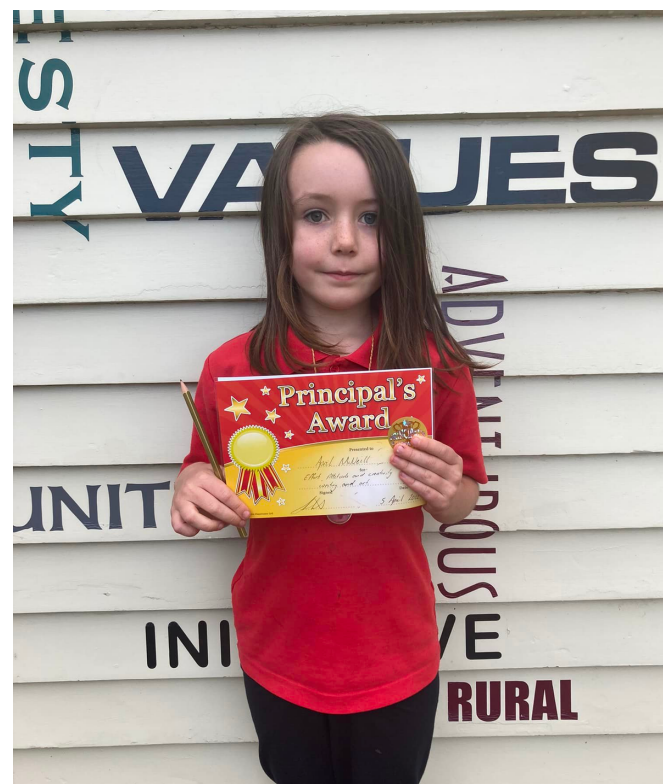
Certificate winners from this week's assembly